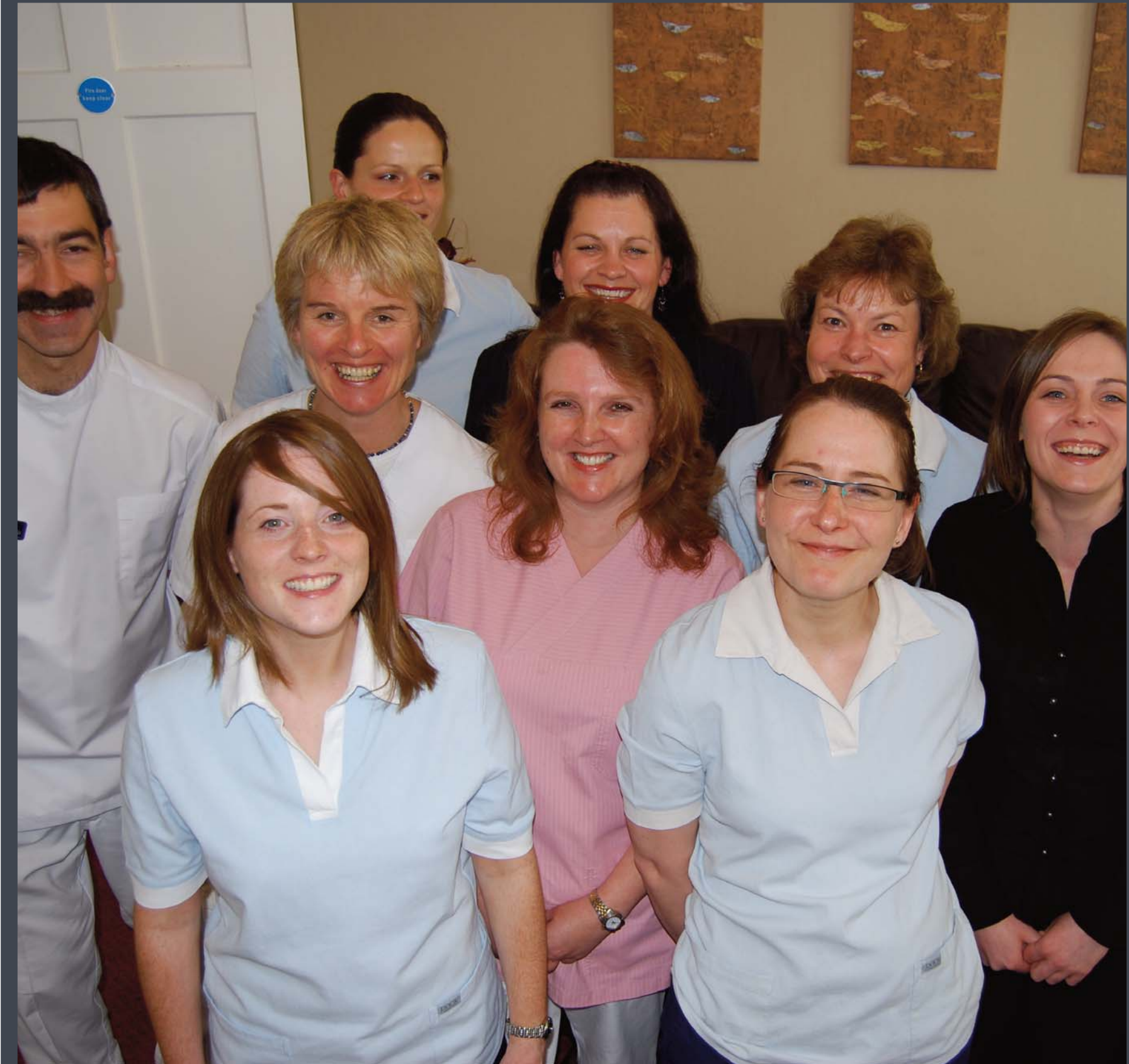
STAFFORD STREET DENTAL CARE